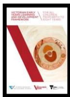
Victorian Early Years Learning and Development Framework

Approved learning framework: A document that outlines practices that educators and co-ordinators must use to support and promote children’s learning. The Early Years Learning Framework (Belonging, Being & Becoming) , the Victorian Early Years Learning and Development Framework and My Time, Our Place; Framework for School Age Care in Australia are approved learning frameworks for use in Victoria ( refer to Sources ).